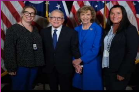
GOVERNOR MIKE DEWINE STATE OF THE STATE

AND IN OTHER NEWS....LITERALLY IN THE NEWS.... ON TV...HOW COOL IS THAT?!!