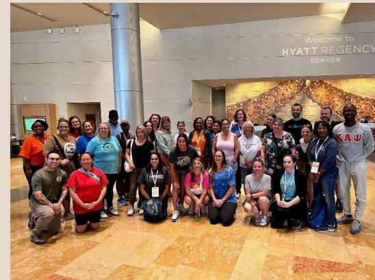
FFTA Group heading to Delores House for the community project